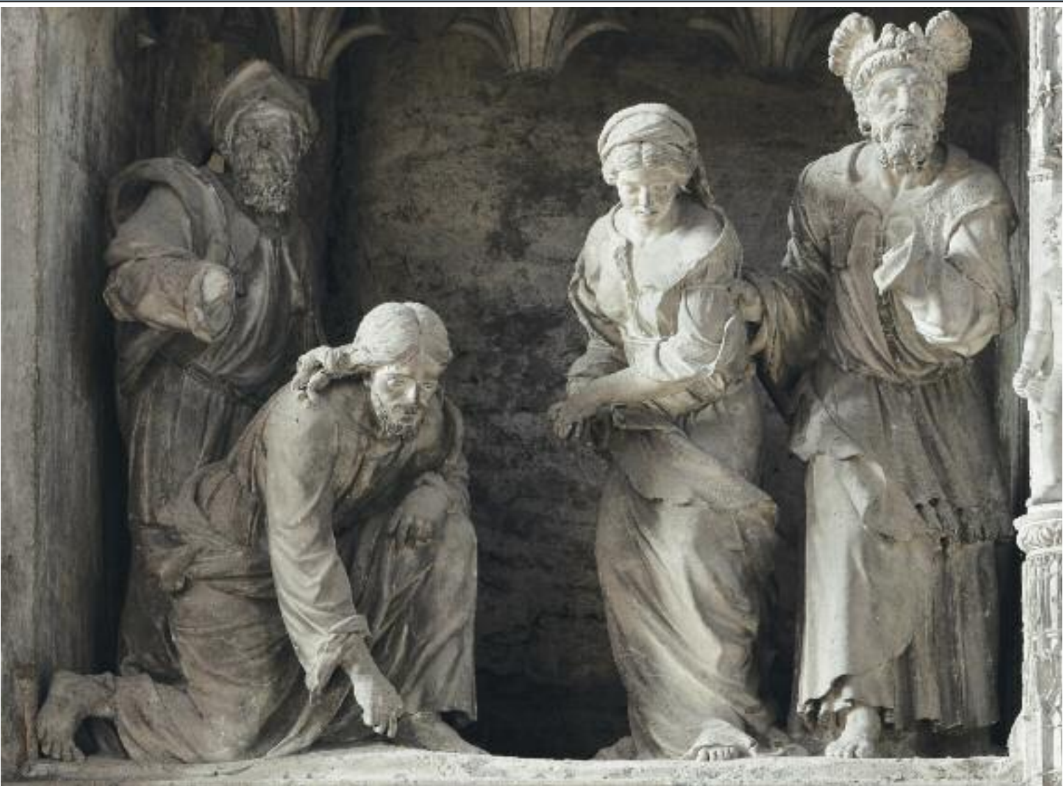
Christ and the Woman Taken in Adultery.