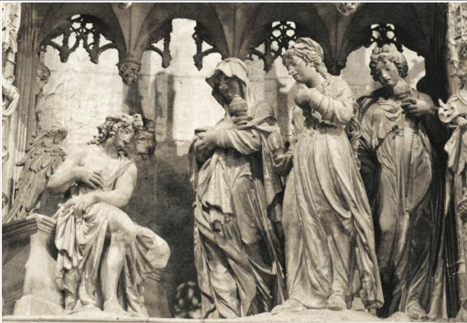
The Three Women at the Tomb.

» creativity and knowledge spring, impacting all areas of personal and social life.