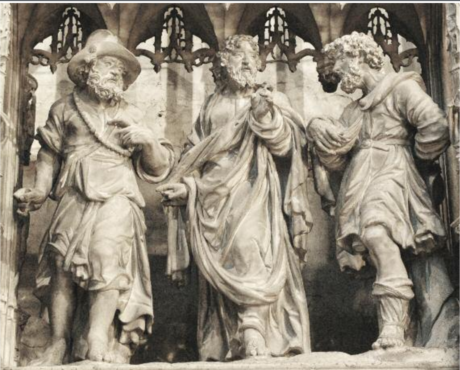
Christ with the Two Disciples at Emmaus.

law does not have. Therefore, in a society in which the principle of the two communities—the origin of the principle of freedom—is in force, you cannot think of imposing a law that has not come from method of civil society, which is first the forming of conviction in practical life and then, in democratic systems of government, parliamentary debate among the elected representatives of the people.